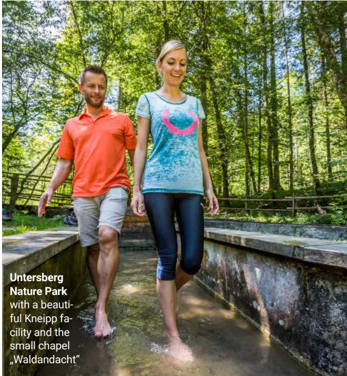
Untersberg Nature Park with a beautiful Kneipp facility and the small chapel „Waldandacht“