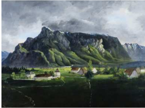
Therese Holbein-Holbeinsberg: View to the Untersberg (1827)