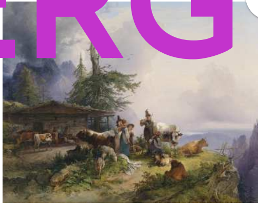
Friedrich Gauermann: Alpine farming on Untersberg (1835)

From Großgmain the path starts at Bruchhäusl to the Vierkaser-Alm (1590 m), where alpine farming is practiced. From there it leads south via Ochsenkopf and Mitterberg to Berchtesgadener-Hochthron (1972 m). To the North it leads to the Salzburger-Hochthron (1853 m) or the Toni-Lenz-Hütte. Via the Hirschanerkopf you reach the Zehnkaser-Almen. Another path, which is located between Großgmain and Fürstenbrunn, leads over the Klingeralm (1526 m) to the Vierkaser-Almen as well.