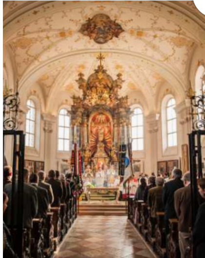
The main altar with Madonna is not only a work of art, but also a symbol of the spiritual connection and hope.

This extraordinary and unique statue is installed at Marienplatz, which is known far beyond the country's borders. It is a Mary in the dress of the Roman mother goddess Diana. A double-sided figure, with two faces and breasts from which water flows. This distinctive design elements originate from Renaissance and Baroque periods, when people had a faible for combining Christianity with ancient mythology, because they saw it as the perfection of Western culture.