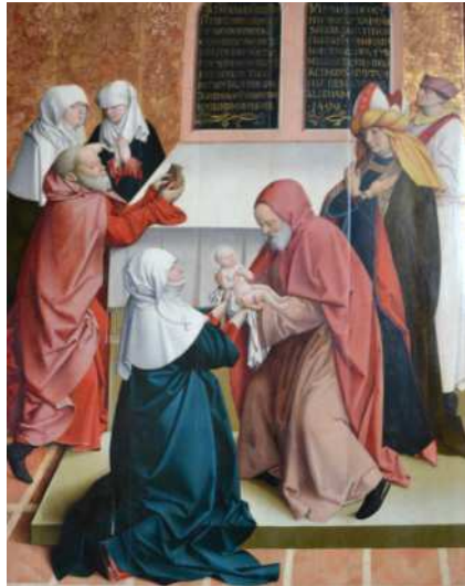
The Master of Großgmain created panel paintings depicting scenes from the life of Christ.